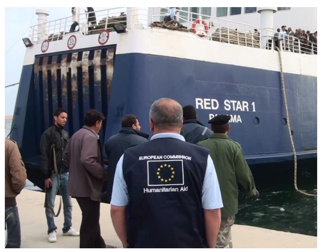
Survivors of Misrata Experts of the European Commission's Humanitarian Aid and Civil Protection department (ECHO) were on hand at the arrival of the latest ship carrying migrant workers and critically injured people from Misrata, Libya.

Senior Researcher, Danish Institute for International Studies