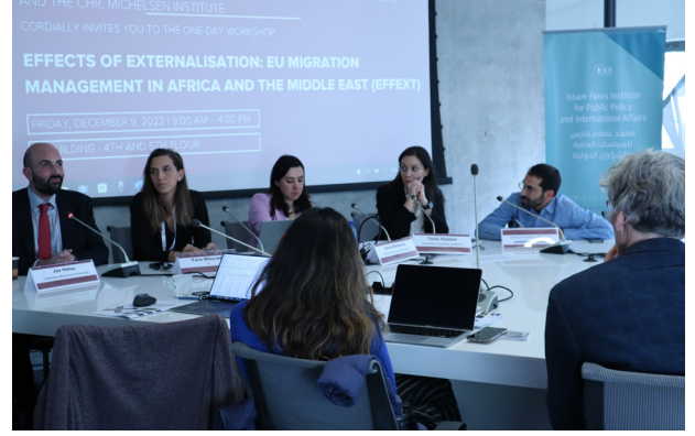
Mid-project meeting in Beirut, Lebanon in December 2022. Co-hosted between CMI and the Issam Fares Institute for Public Policy and International Affairs at the American University Beirut. Policy-makers and academics met to discuss the implementation of EU policies in the Levant, and the challenges faced by the EU and Levant countries alike.