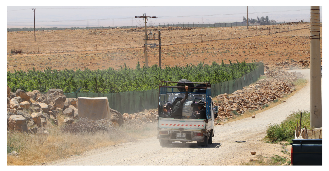
Workers travelling to agricultural work

Senior Lecturer, Centre for Development and Emergency Practice, Oxford Brookes