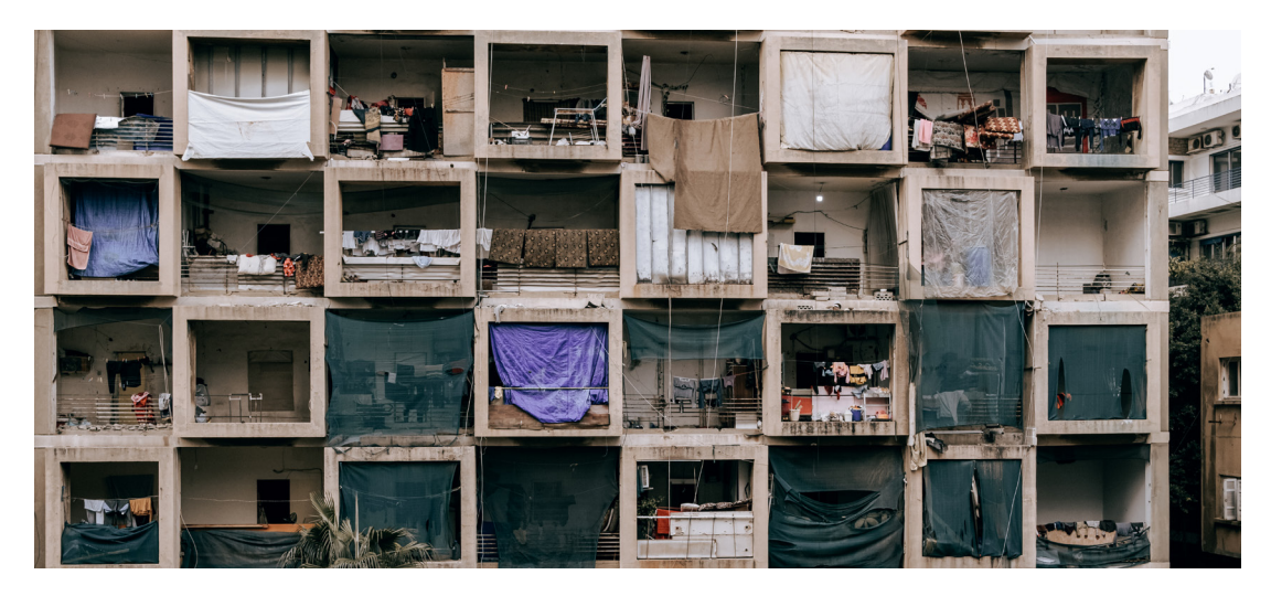
Dilapidated building rented to Syrian refugees in Hamra, Beirut

Senior Researcher, Chr. Michelsen Institute