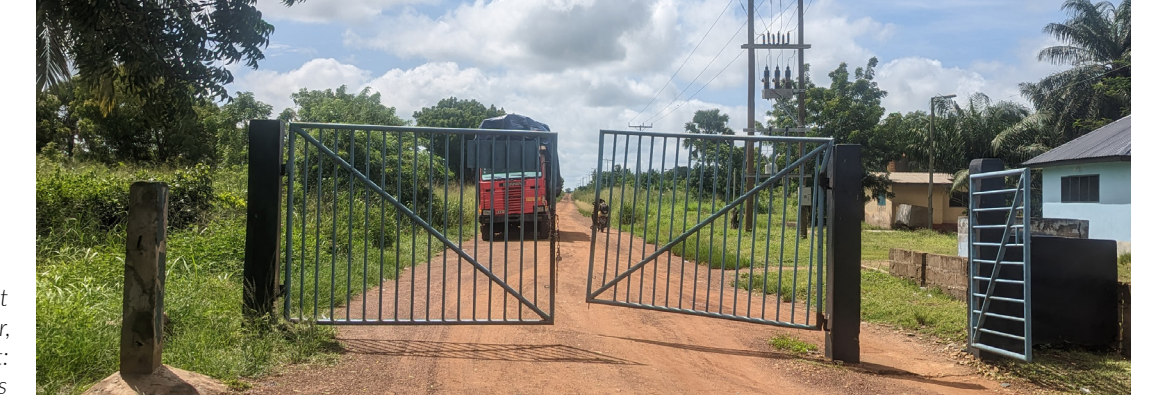
Border check-point at the Ghana-Togo border, 2022.