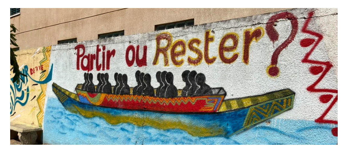
Street art with the slogan "Leave or stay?" painted during one of the European-funded campaigns in Dakar.

Senior Researcher, Danish Institute for International Studies