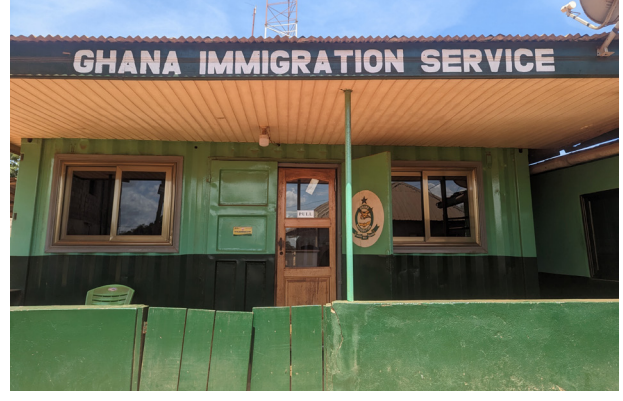
Ghana immigration service building.