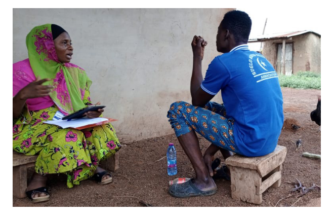
Practicing interviews in Ghana.