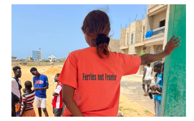
Female activist at the Push Back Frontex campaign that aimed to inform the local population about the European Border and Coast Guard Agency and the brutality of externalisation in Senegal and North Africa.

Traditional fishing canoes along the beach in a community North of Dakar, Senegal where European-funded campaigns have tried to convince the youth not to embark on dangerous migration journeys.