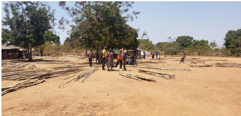
Figure 2: Local materials for construction of the first accommodation in the center of Marrupa-Chiure in September 2020 when the number of displaced people began to grow, and new districts began to welcome people.