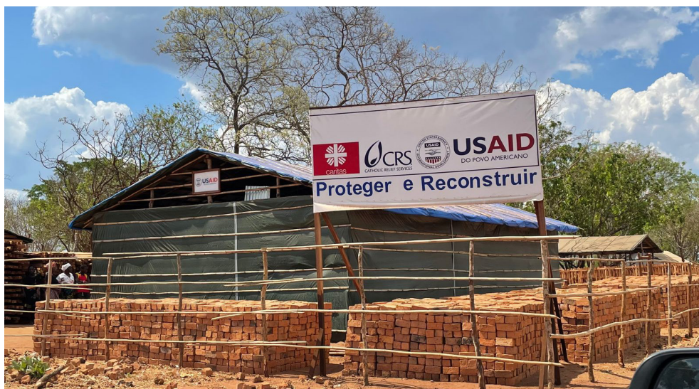
Figure 3: Visual representation of a reception centre in Chiure with identification of some of the international organisations that support it.

In sum, we argue, these features are salient not only throughout Cabo Delgado but not least in the centres for the displaced and may go some way to explaining the moderate levels of resilience to violent extremism manifested in the poor connect- edness between the communities in the origin areas and in the displaced centres. Further, the dynamics presented above are consistent with the general development