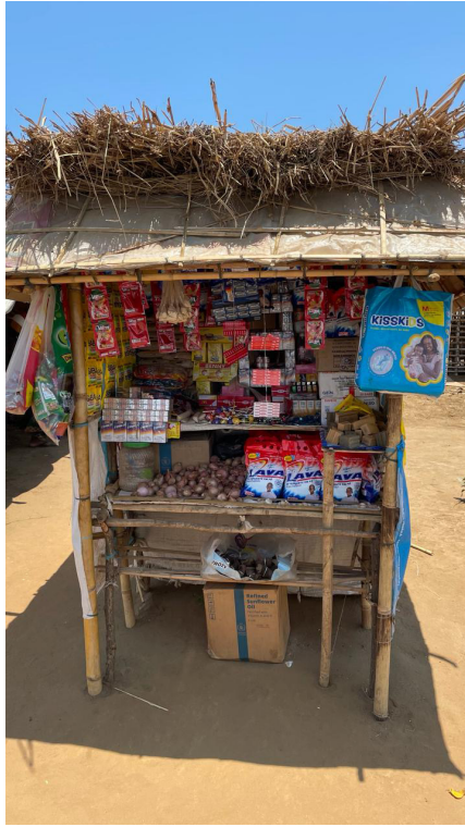
Figure 6: Business selling essential products mainly managed by people from fishing communities.

Through the implementation of a programme geared towards providing technical training and paid internships, young people from fishing communities are served by mobile training units. 76 However, despite the implementation of training in areas such as carpentry, complaints and adaptation challenges persist. Generally, host communities complain about high labor costs and pay well below the market, alleging inexperience of these new service providers.