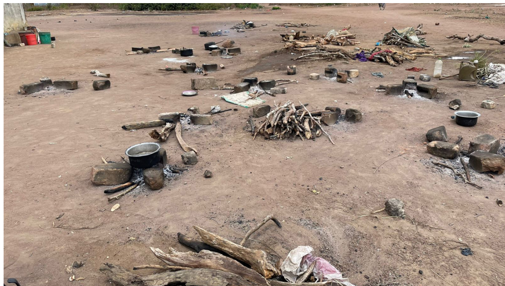
Figure 5: Displaced Persons Center with irregular food assistance in Balama.

The distribution of food is primarily undertaken by the WFP with the support of CSOs contracted for this process. However, the registration of beneficiaries, a key prerequisite for the distribution of food, is exclusively done by government authorities at the local level. Crucially, these often reflect patterns of corruption or patronage to benefit family members or other people based on ethnic and/or religious affinities, mainly in reception neighbourhoods and to a lesser extent in accommodation centres where people are registered based on time of arrival. Under these circumstances, food distribution and other support is somewhat biased despite local authorities insisting that there are absolutely no criteria based on origin in the distribution of support.