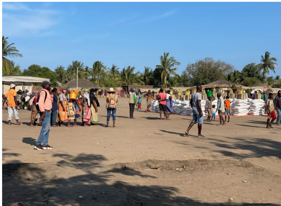
Figure 4: Distribution of food kits at a displacement centre in Metuge District, October 2021, Cabo Delgado Province.

in these centres where people from different contexts are practically forced to share space despite their differences.